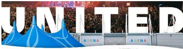
at the EAST OF ENGLAND SHOWGROUND, PETERBOROUGH

We send this update every week on a Thursday - to sign up, please go to st-gabriels.org/hello