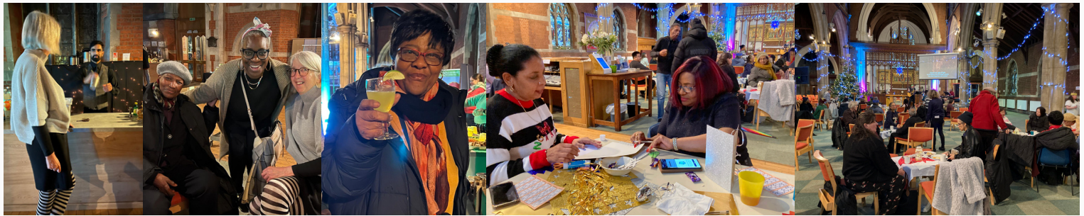
Happy scenes from Hope Cafe Christmas celebration and 'Let there be Light' gathering for team & clients in January

Hope Cafe offers debt and financial support, with a listening ear and practical help. For regulars, CAP contacts & clients and for new visitors, we assist with form-filling and administrative tasks, signpost or refer to other services, offer pastoral discussions on worries or anxieties, friendly chatter over a healthy lunch snack and occasional speakers on topics of practical life skills, health and well-being. It is open from 1pm to 3pm every Monday, regularly serving 50-70+ guests. The cafe achieved 5-star health and hygiene rating in 2024 and the Compassionate Communities team within the Diocese of London came to make a video in recognition of its community impact to date (see YouTube 'Local, Accessible, and Open to All: The Hope Café at St Gabriel's, Cricklewood'). This has inspired other churches and we regularly host guests wanting to see it for themselves. We are working on developing this proven entry point for belonging, dignity, fellowship and access to help, by formalising the support aspect to cover regular expertise on debt, mental health, and hopefully housing, benefits and immigration too, as the most popular support topics arising.