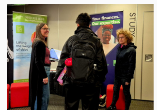
At Freshers' Fair and Student Money Day, reaching out to students with money coaching tips

In 2024 we ran four courses (38 signed-up guests) using the new Money Coaching resources and training. There continues to be an enthusiastic reception for the videos, Money Journal and topics covered - how & why to build a budget, credit, debt, savings, scams, planning ahead and maintaining and adapting budgets to serve for the long term as life changes. We have retrained a returning Money Coach and trained up two new ones, so now comprise a team of seven. Success from presenting a 10-15 minute budgeting approach to students at a Freshers Fair in October inspired kicking off 2025 by trialling a series of one-hour taster sessions and then a follow up full course. Across five taster sessions we have reached as many as 90 people with a flavour of how to budget, 9 people completed a full course, over 30 people registered on the sessions and half signed up to use the free online budgeting tool. Two courses are pending at potential partner churches and a date will be secured to run a student course next semester.