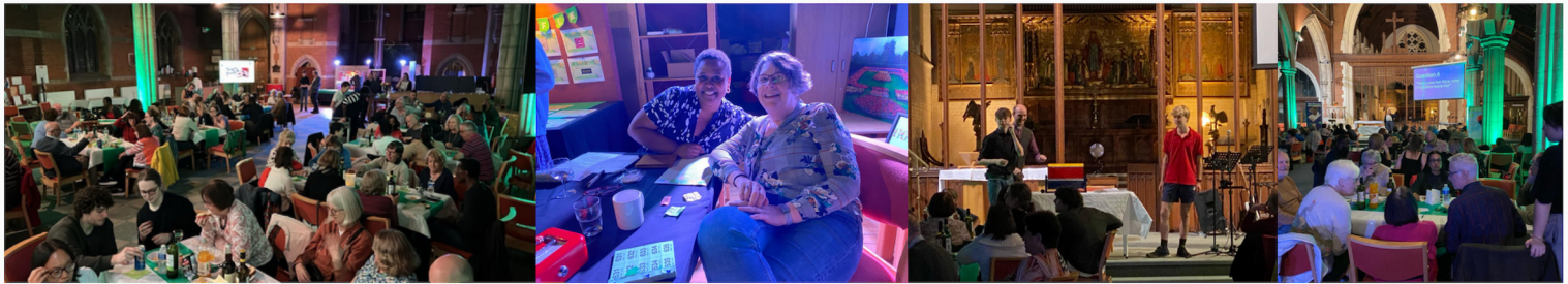
CAP Fundraising event & quiz, with raffle and art auction

Save the Date! CAP Fundraising event at St Gabriel's - Friday 11 October 2024, evening