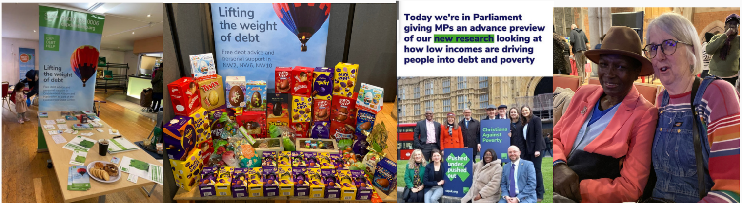
CAP stand at Sufra project in Stonebridge; Easter & Christmas donations for clients from St Gabriel's; campaigning, informing & befriending.